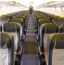
Business Class: 70-98 seats

The 757-200 is the most versatile aircraft in the fleet, giving you even more choice. The three most popular configurations are a) 198 standard, b) 40 business class/108 standard and c) 70 or 98 business class. The split between business and standard seating works particularly well. Plus we can give you other options, just ask us. Beyond this, the modern twin engine jet is quiet, comfortable and can undertake regional and international routes all over the world.