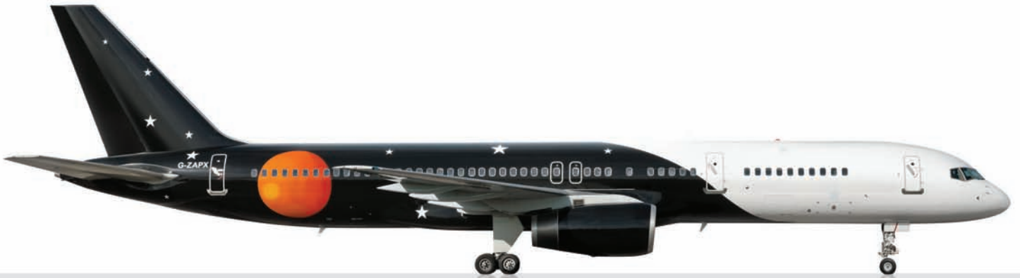
Standard: 198 seats