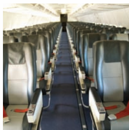
Business Class: 44 seats