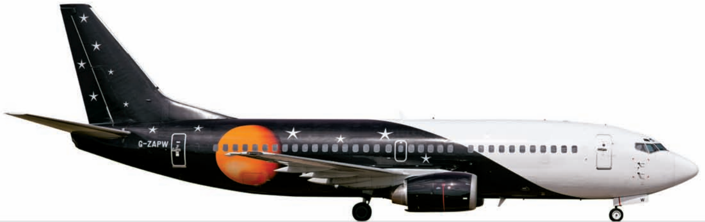
Standard: 130 seats